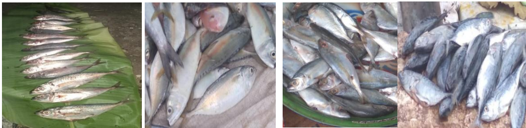
Fig. 3. The Fish Catch of The Fisherman Karangmangu

Based on the results of the identification of the diversity of fishes on the beach Karangmangu, there are four fish species from two families who presented in Table 2. Based on the results of the analysis of fish have been identified at the beach Karangmangu that there are 168.000 individuals of 4 species. The results of the analysis of the abundance of the fish species found are presented in Table 3. The results of the analysis of the diversity of the fish species found are presented in Table 4. The results of the analysis of the dominance of the fish that is found is presented in Table 5.