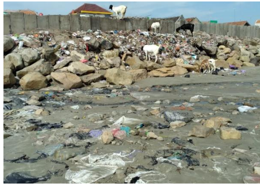
Fig. 2. The garbage disposal is accidental to the aquatic ecosystem of the ocean