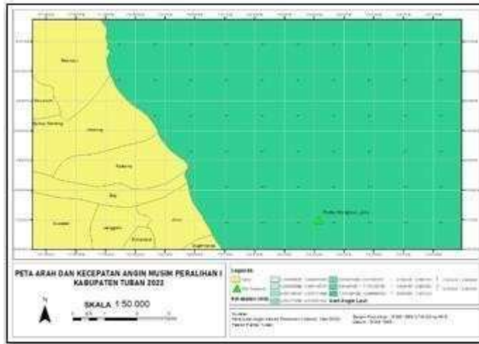
Fig. 4. Modeling of wind direction and speed for first transitional season in coastal areas in 2022

Meanwhile, the direction and wind speed of east monsoon season (data for June - August) in coastal areas is dominant towards southeast (southeast) with an average wind speed of 5 m/s in TPI Glondong, Tambakboyo point areas and 5.4 – 5, 5 m/s in Gadon beach point area, Tambakboyo Fig 5.