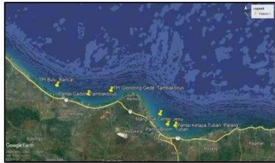
Fig. 1. Research location for marine physics data, points were taken 2 miles from shoreline of Tuban waters